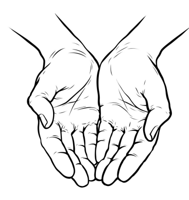
Quality of care